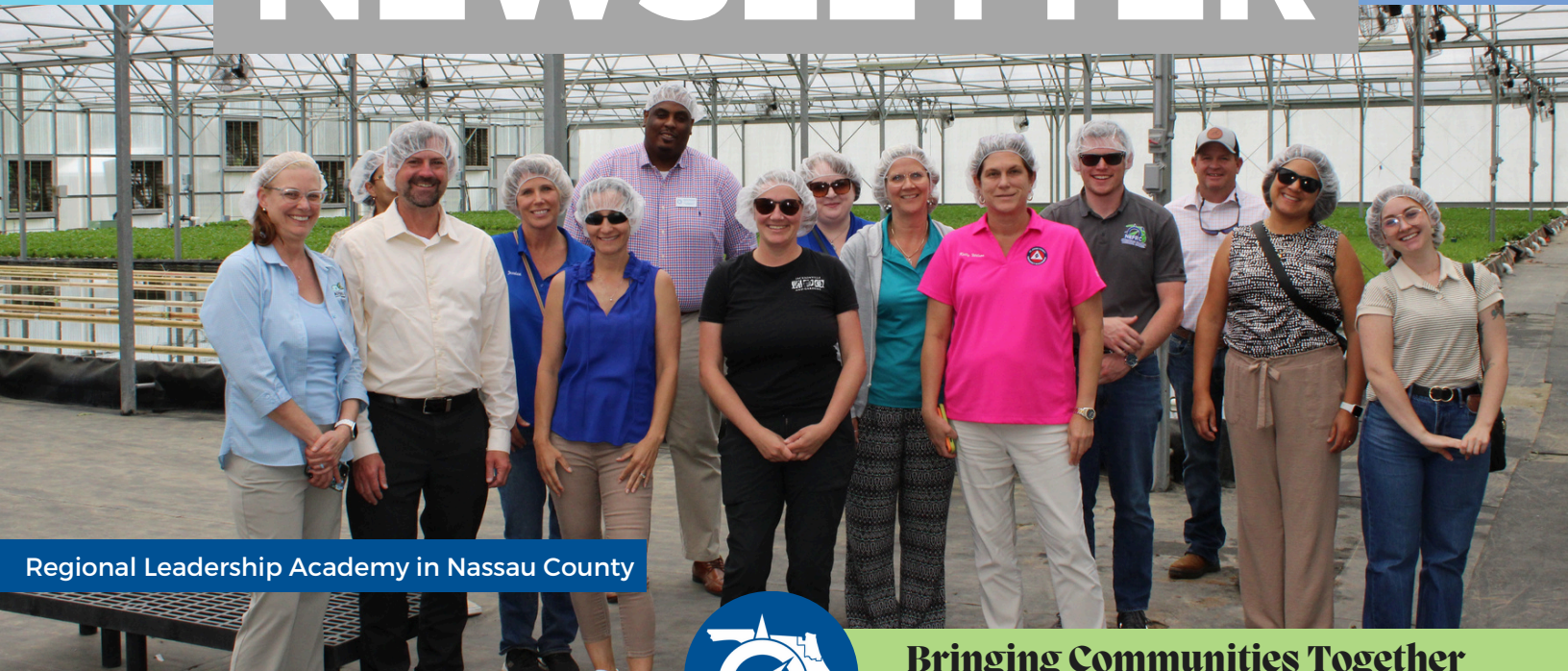
Regional Leadership Academy in Nassau County