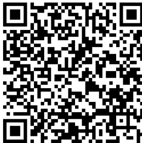
2023 Legislative Priorities