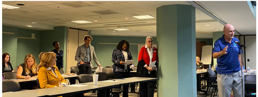
Access to Healthcare Working Group Meeting November 7, 2022

Staff highlighted the NEFRC's ability to assist other local governments with these types of projects in the future.